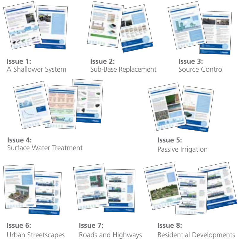
Issue 1: A Shallower System

By providing shallow stormwater retention, attenuation, infiltration and treatment at source, the Permavoid system offers a versatile solution for a wide variety of applications, and can be used as part of an engineered or soft SuDS solution in greenfield and urban areas. It also enables designers to offer a system that incorporates water treatment and passive irrigation, to manage and re-use water at source.