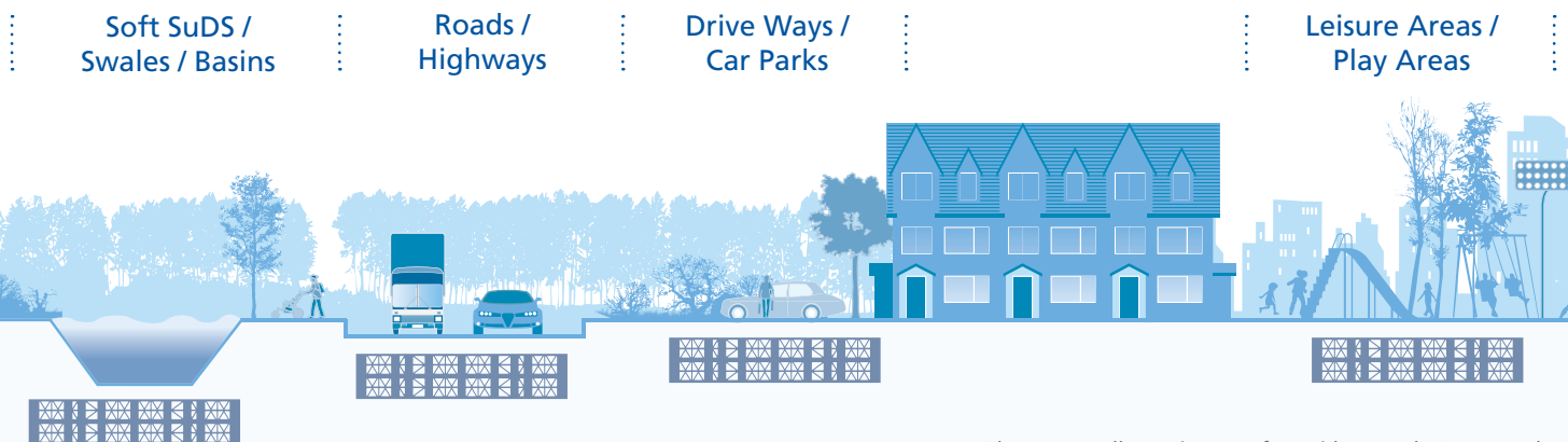
Please note: Illustrations are for guidance only. Not to scale.

The system can be installed beneath impermeable and permeable, trafficked and non-trafficked areas, and incorporates a range of components that can effectively separate silt and hydrocarbons at source improving biodiversity. This eliminates the need for large, deep silt traps, oil separators and pumping stations.