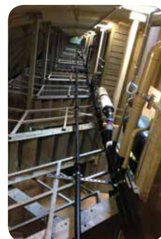
P.A.P.A. system testing at the National Lift Tower